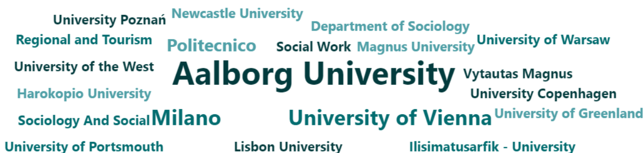
Figure 3 Word cloud of the registered participants organisation

In total 79 participants had signed up for the end conference but, as some signed up twice, the number of registrations was actually 70. Of these were the three keynote speakers, 23 members of the COHSMO team, five members of the Danish NAB (national advisory board), another ten participants affiliated with Aalborg University and finally 29 others. On the day, 65 participants joined for an average of 243 minutes each.