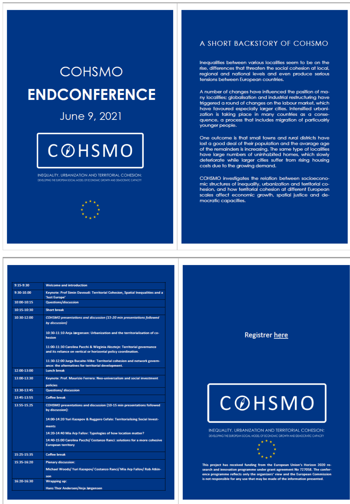
Figure 1 COHSMO invitation